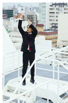
ASICS x keisuke kanda x ANREALAGE Jersey meets suits