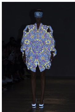
ANREALAGE 2016 S/S COLLECTION «REFLECT» © 2015 ANREALAGE