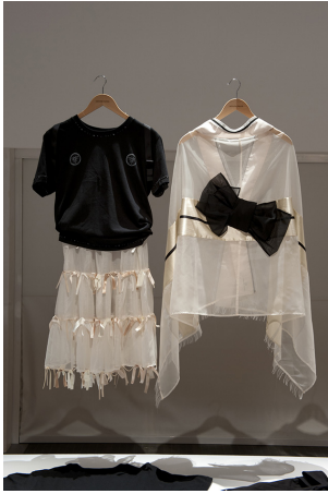
Installation view Keisuke Kanda + ANREALAGE, ANOFUKU, 2017