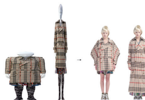
ANREALAGE 2010 AW COLLECTION « WIDESHORTSLIMLONG »