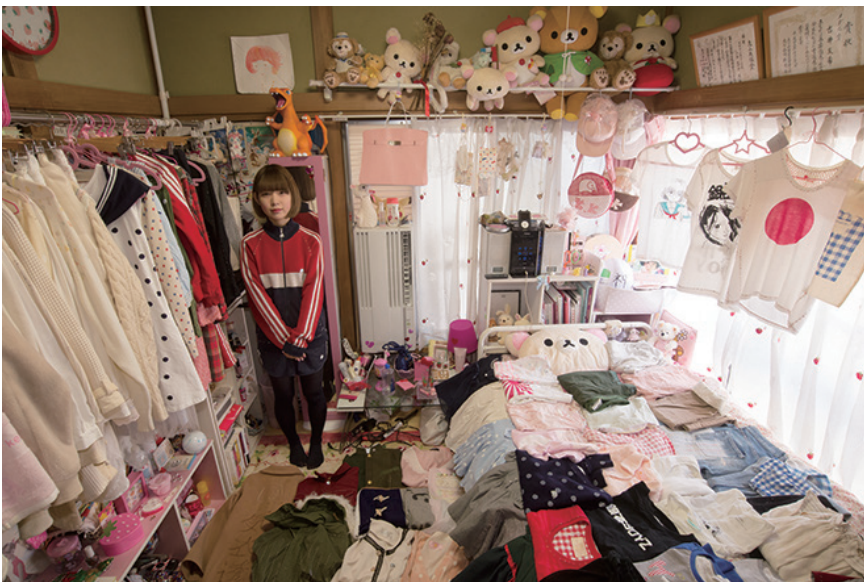
Kyoichi Tsuzuki HAPPY VICTIMS - keisuke kanda