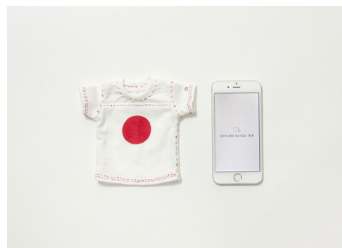
keisuke kanda keisukekanda_AIR