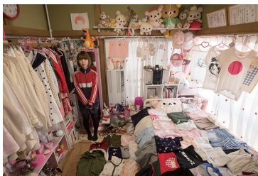
Kyoichi Tsuzuki HAPPY VICTIMS - keisuke kanda