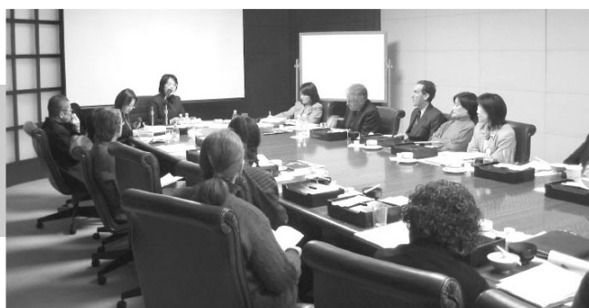
Publicity projects at the 47 th APAP conference