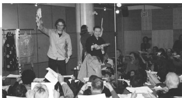
Kyogen lecture and demonstration

The Foundation and the Munk Center of the University of Toronto jointly conducted this symposium, which discussed three central themes: aging society, architecture and urban planning in Japan and Canada, and films and literature of contemporary Japan. A total of 8 researchers of Japanese studies gave presentations. The audience commented that it not only introduced present-day Japan and its social problems but also hinted at their relevancy with which they could compare with the social problems of Canada.