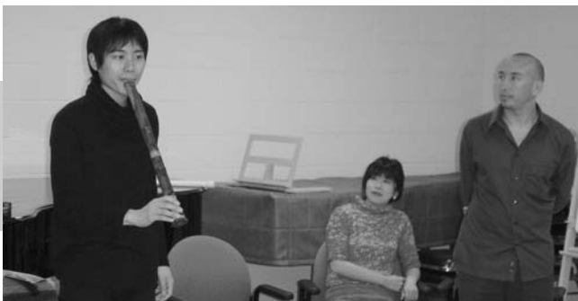
Koto and shakuhachi concert

The LA Office prepared 2,000 advocacy kits for the K-12 Japanese-Language program, each kit containing a booklet and a 17-minute videotape of actual classroom scenes as a countermeasure against the trend of reducing foreign language education. The kits, which had received favorable feedback from Japanese-Language teachers in remote areas in Australia, were distributed to educational institutes and diplomatic establishments in the United States.