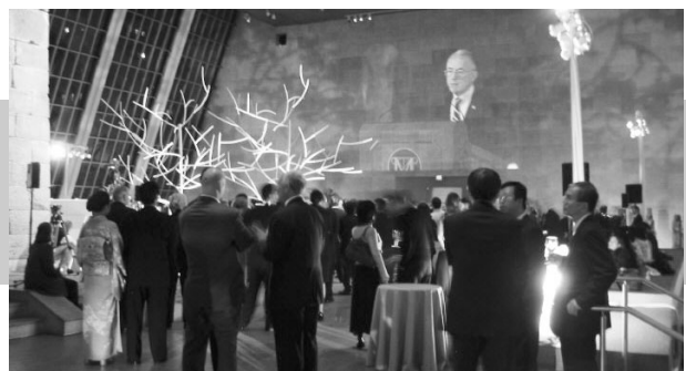
"Art of Oribe and the Momoyama (late 16 th century) culture"