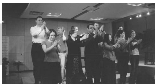
Reading of Tsuki no Misaki