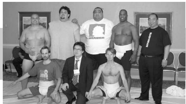
US Sumo Open 2004