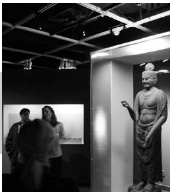
"Early Buddhist Art of Japan and Korea"

The year 2003 saw Canada facing several challenges, starting with an epidemic of SARS. The economic slump worsened, and Air Canada, the largest airline company in Canada, applied for the Company Rehabilitation procedure under the Bankruptcy Protection Law. Mad cow disease was found in Alberta, which resulted in a ban on the import of Canadian beef in Japan. In the political scene, Paul Martin assumed office as the 27 th Prime Minister, replacing Jean Chretien who had been in office for ten years. Prime Minister Martin formed a new cabinet with three major promises: reinforcement of the social foundation, restructuring of the economy, and establishment of the role of Canada as a contributor to the international community. The GDP growth rate remained at 1.7%, 1.6 points below that of the previous year. In the cultural scene, Canadian films made remarkable achievements